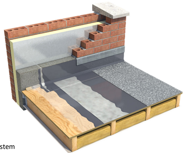
ENVIROFLEX® Waterproofing System incorporating the Enviroflex Anti-Skid Surfacing